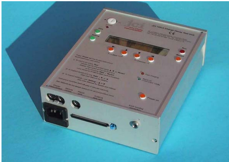
JCI 155v5 Charge Decay Test Unit

Many of the useful opportunities presented by static electricity and many of the risks and problems it can cause relate to the influence of retained electrostatic charge. This is manifest as the surface voltage created by the charge retained. The 'suitability' of a material may be judged in terms of the maximum surface voltage created and/or by the time for which this is maintained.