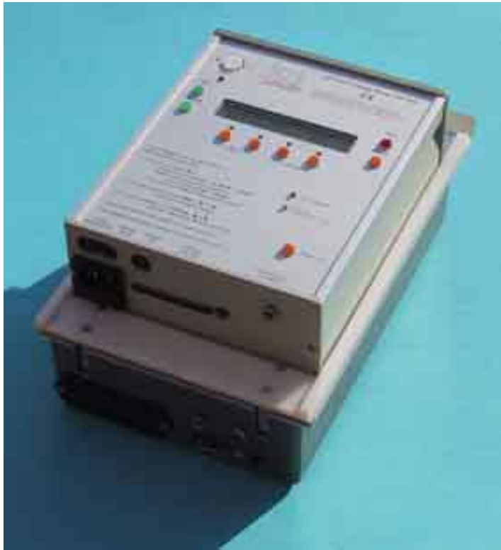
JCI 155v5 on JCI 176 Charge Measuring Sample Support

Powder samples may be presented using the JCI 170 Powder Sample Support with the JCI 155v5 supported by a JCI 172 Support Plate so the JCI 170 can be easily put in place and removed and so that the baseplate of the JCI 155v5 is stood off a few mm to reduce risk of powder dispersal into the air by action of the air dam. Powder, and liquid, samples can alternatively be presented for testing using a JCI 173 Powder Sample Support Plate mounted between the plates of a JCI 176 sample support.